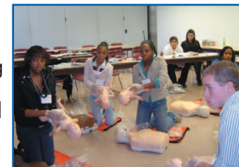
ACES students getting CPR certification