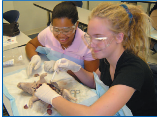
ACES students dissecting a fetal pig

The PRIMO ACES/ACES+ program is for high school (ACES) and undergraduate students (ACES+) who display strong interests in pursuing careers in primary healthcare. Students who are interested must have a 3.0 GPA (on a 4.0 scale) and submit a completed application that includes: