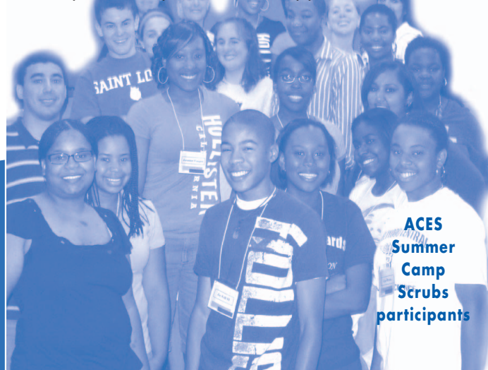
ACES Summer Camp Scrubs participants