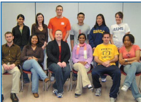
Saint Louis University Medical Student Mentors (Doctors for Diversity Student Interest Group)

The ECMO AHEC region includes St. Louis City, St. Louis County, St. Charles County, Jefferson County, and Franklin County. The target communities within these counties are those designated as medically underserved or having a shortage of health professionals.